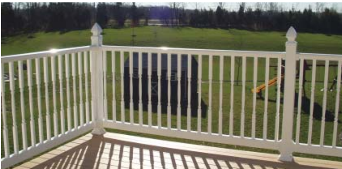
Harth Builders used a 42-inch vinyl railing for the sundeck in lieu of the standard 36-inch rail, which eased the homeowner's concerns for their young children's safety.