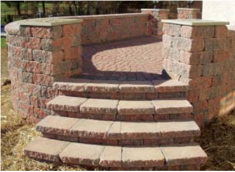
The EP Henry paver patio provides a graceful transition from the sunroom to the existing walkway to the pool and driveway.