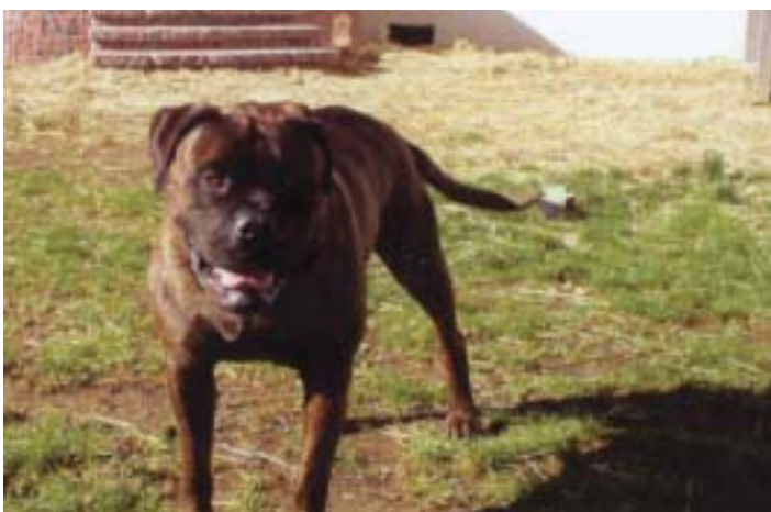
Subcontractors were wary of Sunny, the 150- pound bullmastiff. However, it was really Honey, the 4-pound toy fox terrier, who was the one to watch.

antique white, which isn't a standard color offered by any local stucco supplier. "We used a trial and error process to discover the right formula," Harth says. After creating many samples, it was determined that the original color was one antique mixed with three white.