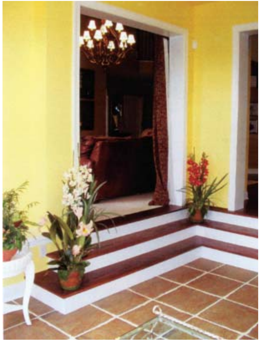
Porcelain tile achieved the look the homeowners wanted at half the price.

Andersen® sliders and circletops on the southern wall match existing windows and doors. A triple slider provides access from the master bedroom to the sundeck. Harth Builders recreated the existing box window on the west wall to allow the homeowners to reuse a fairly new wine-colored velvet seat cushion and a box window. A pair of 6-foot mullied windows complete the east wall.