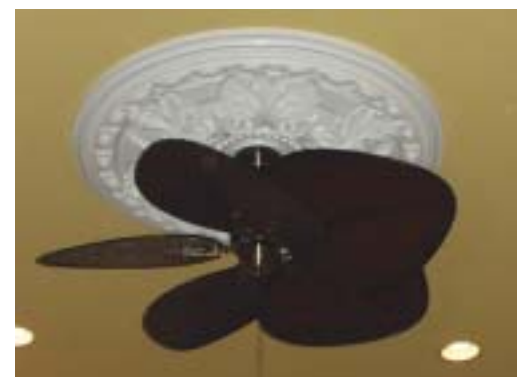
An ornate architectural medallion above the Casablanca fan is consistent with the rest of the house.