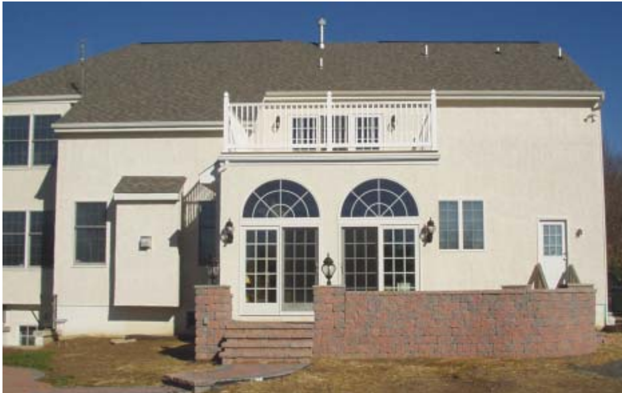
BEFORE ▼ AFTER ▲