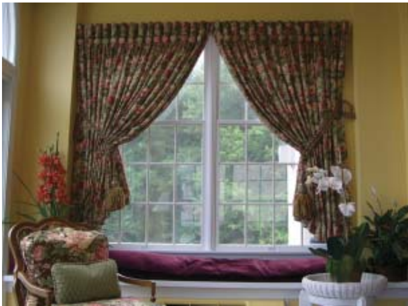
A set of recently purchased drapes was reused in the sunroom.

But the addition had to blend with the existing house. "I hate when you see an addition and you can tell it was added on," Tamara says.