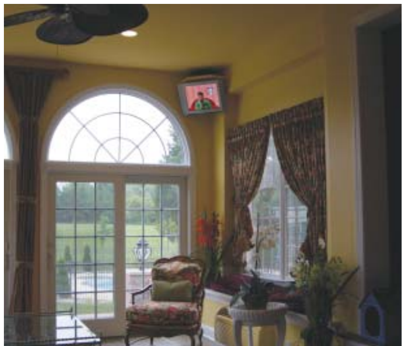
A LCD TV hangs in the corner and covers the cable and outlet.

Matching existing stucco was another problem. The first attempt was too gray. The homeowners thought the existing color was